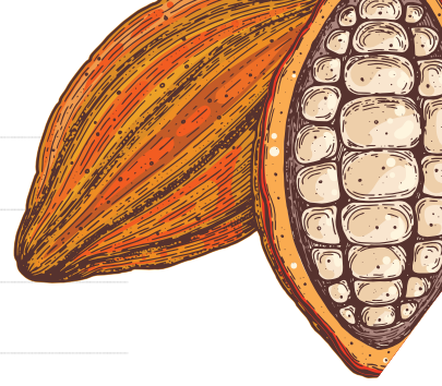
Figure 1: Main regional cocoa associations quarterly grindings of cocoa